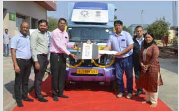
Akshaya Patra's Ahmedabad kitchen welcomed the team from Vetoquinol India Animal Health Private Limited for the official flag-off ceremony of the meal delivery vehicle they generously sponsored.