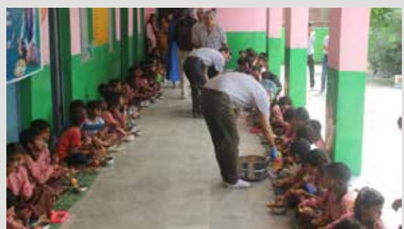
On their special day, 26 September 2024, Gebr. Pfeiffer contributed substantially to support Akshaya Patra's mid-day meal programme and provide sustenance to homeless mothers. They also sponsored a Mahindra Bolero vehicle to deliver nutritious mid-day meals to thousands of children. The occasion was marked by the presence of their Managing Director, top management and 45 employees.