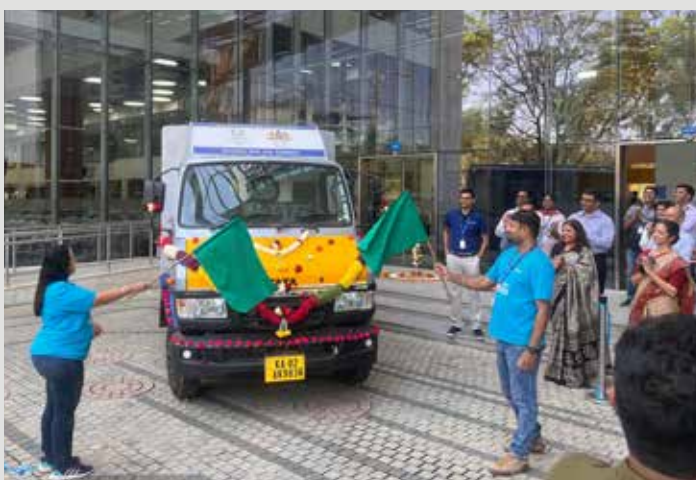
Global leaders from NTT Data officially inaugurated a new meal delivery vehicle for Akshaya Patra's HK Hill kitchen in Bengaluru. Additionally, NTT Data's volunteers showcased their creativity by beautifully hand-painting 53 tote bags.