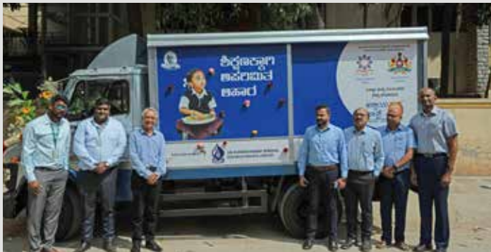
Sri Kumaraswamy Mineral Exports Private Limited generously contributed two delivery vehicles to The Akshaya Patra Foundation in January 2025. Each vehicle can carry 5,000 meals to government and government-aided schools in Ballari, Karnataka.