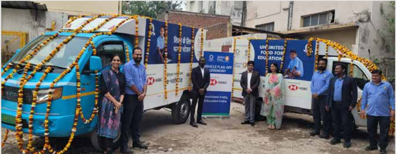
HSBC inaugurated two eco-friendly electric vehicles in Delhi, as part of their support to Akshaya Patra's mid-day meal programme in three locations: Delhi, Hyderabad and Mysore.